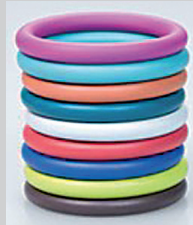
Color-coded O-rings first developed by Parker Seal.

The previous examples show an educated effort to select an O-ring for a specific application. But many companies don't put this level of thought into their self-sealing fastener assembly, and are obviously not aware of the critical importance of O-ring selection. They opt for random O-ring selection instead of having a qualified sealing engineer specify the proper O-ring. Random O-ring selection increases the probability of self-sealing fastener failure and greatly increases a company's product liability. The best way to assure sealing success in any application is to communicate the application variables to a sealing Design Engineer at the company where you buy the product, and let them select the best O-ring for the application. The best way to limit liability is to buy guaranteed self-sealing fastener products from firms like Sealtight® Technology , Santa Barbara, CA, USA, which has an engineering staff to assure customers receive the proper O-ring for every application. If your company does not purchase self-sealing fasteners from a company that offers engineering support, then it would be wise to find a company that does. If you are at a loss as to what self-sealing fastener assembly would be best for your application, just remember that consulting a Design Engineer can help you avoid self-sealing fastener failure.