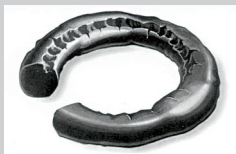
O-ring failures due to compression set (top), abrasion (middle), chemical degradation (bottom).